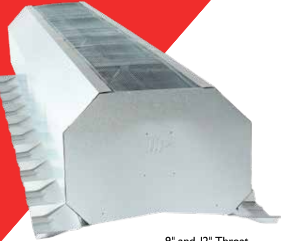
9" and 12" Throat Continuous Ridge Ventilators