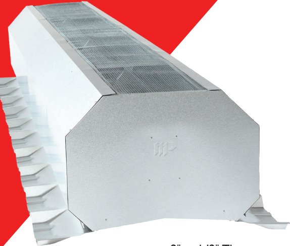
9" and 12" Throat Continuous Ridge Ventilators

Standard ridge ventilators are shipped with a 1:12 end cap and can be field modified to accommodate up to a 6:12 roof pitch. Ventilators can be custom ordered to accommodate roof pitches greater than 6:12.