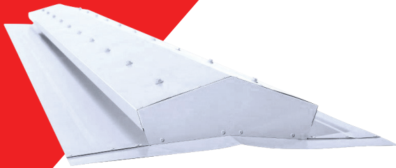
Low-Profile Ridge Vent

Metallic Products' low profile ridge vents are aesthetically pleasing and an extremely efficient means of ventilating metal roofs. Each unit is manufactured in 10' lengths and can be installed as a single unit or can be butted together to form a continuous run. By lapping the furnished joint covers over the top of the butted joints in a continuous run, the vent has the appearance of a single unit.